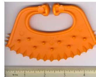
Fig. 1. Plastic weaning ring

A method to reduce stress at weaning has the potential to improve the health and performance of calves. A research group at the University of Saskatchewan's Western College of Veterinary Medicine fitted calves with anti-suckling devices (Figure 1) that allowed regular behavior and social interaction with their dams for at least four days before separation from their dam. The 2-step weaned calves called 85% less, walked 80% less, and spent 25% more time eating during the 4 days following separation compared to traditionally weaned calves. We would expect, that if this behavior is a consistent result of the treatment, 2-step weaning should also offer benefits in improved performance and health of weanling calves. The objective of this trial was to determine weight gain and sickness of calves weaned with the 2-step compared to the traditional method.